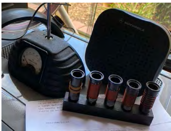
Set of coils for one of the other radios