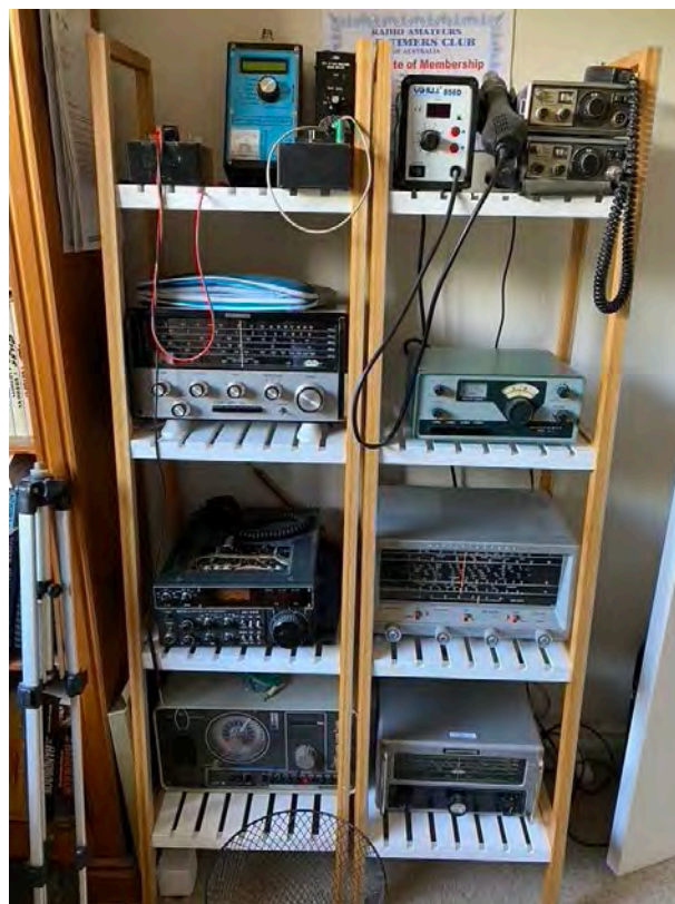
Some of Norm's other radios: EDDYSTONE EC10, an EDDYSTONE 870 receiver and another HW8 plus a HALLCRAFTERS 538