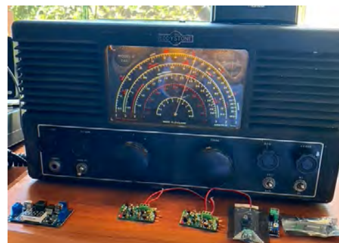
Norm's Eddystone 740