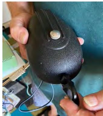
Norm's very rare EDDYSTONE Morse Tapping Key