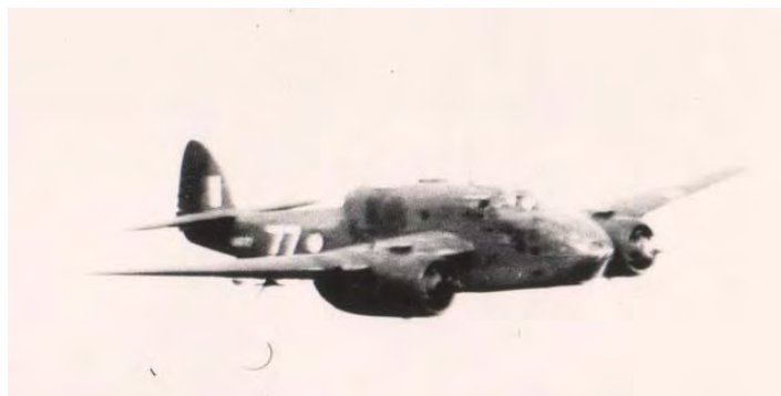
Beaufort IV in flight

Are you looking for a hard-to-get part? A strange knob, or a replacement coil? Have an item that you'd like to sell? Why not place a free, classified advertisement on our website? Go to the TRADING POST page of our website at: https://hrsasa.asn.au/page-16/ and have a look at what's on offer right now and help a fellow member. It changes frequently. Why not make use of this resource yourself?