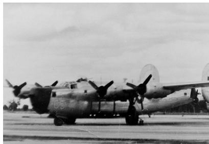
The USAF “Liberator from which the BC348 and ART 13 were recovered

We are planning a visit to Phil’s farm and radio-shed at Goolwa during the first half of 2022. We hope to make a full day of it visiting the Goolwa markets in the morning, having a BBQ lunch at the farm, then a tour of the radio room and all its facilities.