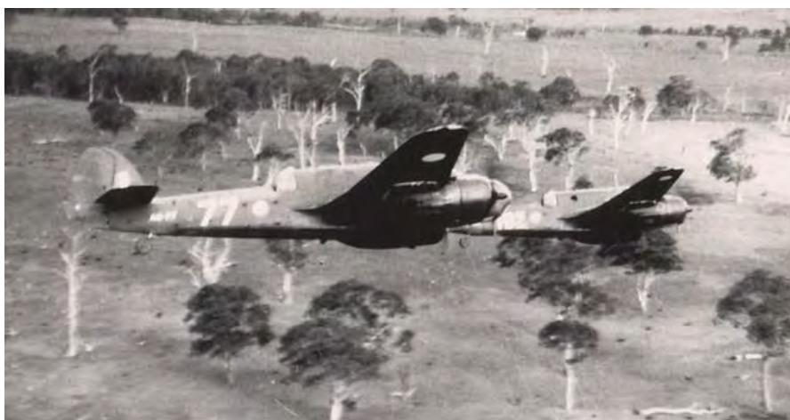
Above: The actual Beaufort aircraft A9-77 in formation during a training flight.