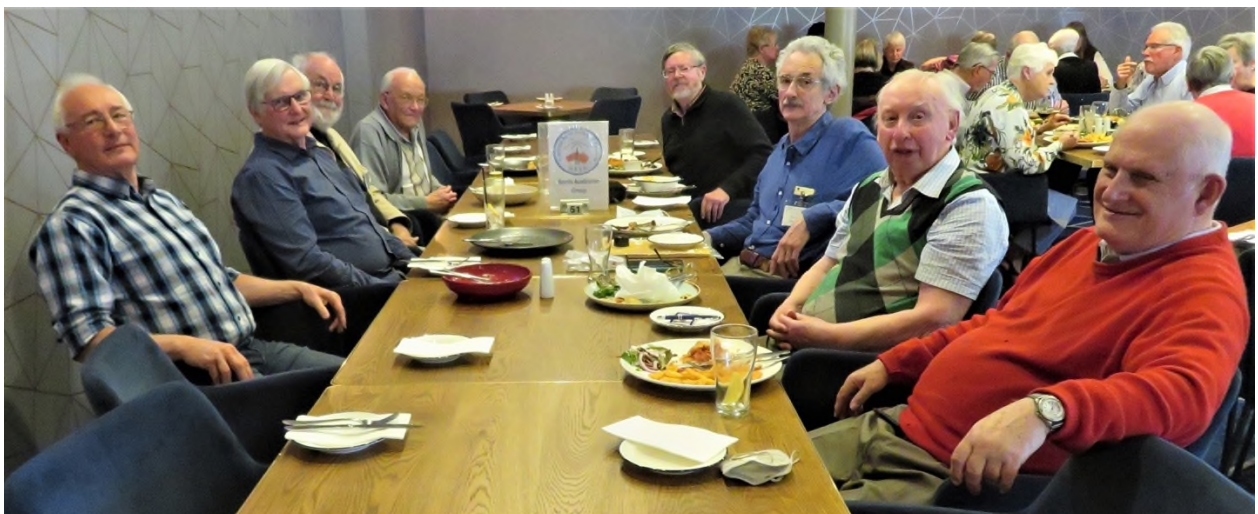
Above: The Retirees Luncheon group at the September lunch at the Earl of Leicester Hotel, Parkside