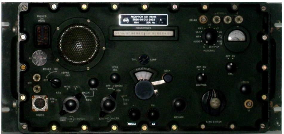
TCA (Philips) R5223 Reception Set