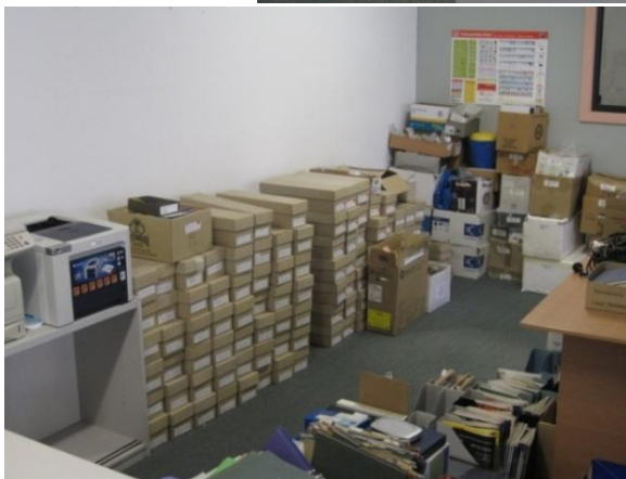
certificate Norm and Miles was awol.