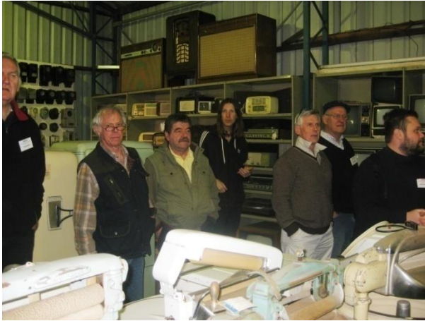
Left: Members inspecting the ‘white-goods’ collection. Note the broadcast radios (wireless sets) in the background.