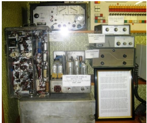
Right: Some of ETSA mobile radios. Left from the top, Traeger MA51 high frequency used on the Radium Hill line construction and an ETSA built 31 MHz mobile radio of 1945. On the right from the top, Kimberley, Philips 1680 and TCA (Philips) 1677.